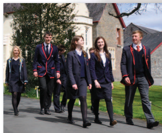
Llandoverly College Senior School

Pupil-teacher relationships are less formal and, in an atmosphere of supportive collaboration and shared ideas, the College endeavours to ensure that every Llandoverian has the best chance of individual success.