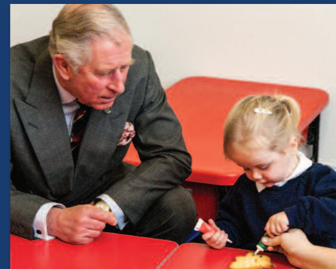
PRINCE CHARLES HRH Prince of Wales opening the Llandovery College Nursery