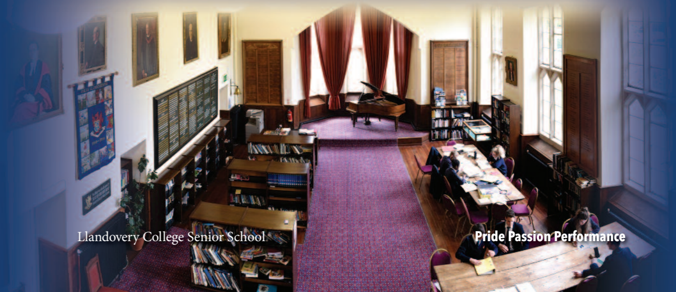
Llandoverly College Senior School

Pupils are guided through the maze of 'life choices' by a Pathways Programme that seeks to broaden possibility and fit options to the individual as well as develop a portfolio of skills that will best equip them for a life of outstanding performance beyond the College.