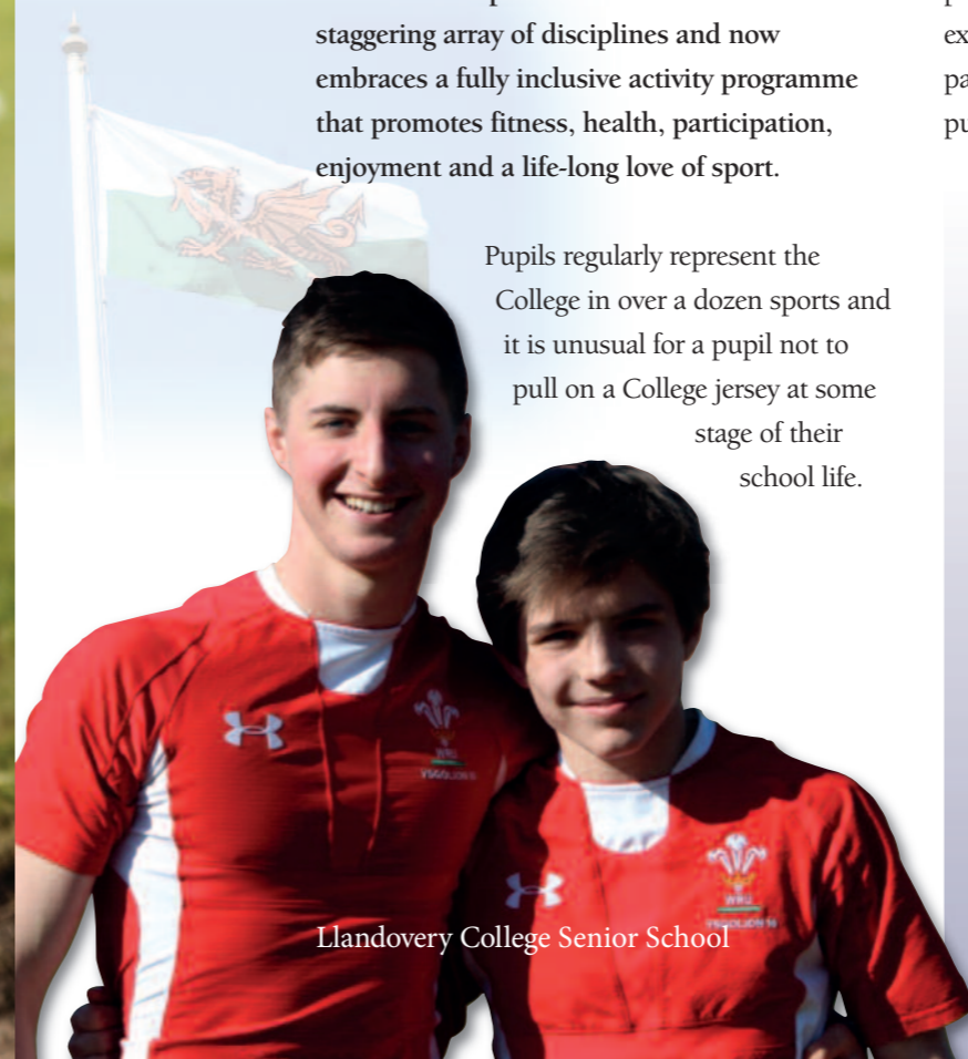
Llandovery College Senior School

George North Former pupil, Welsh International and British & Irish Lion